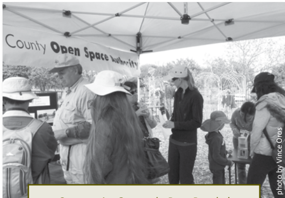
Community Outreach: Busy Booths!