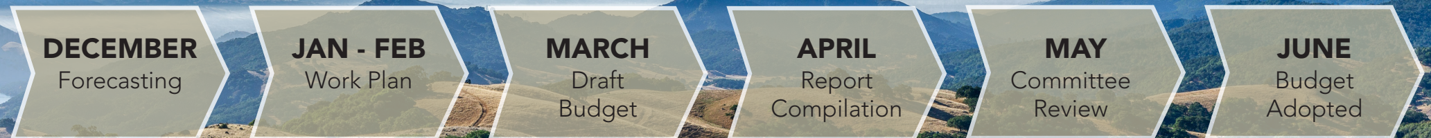
Rancho Cañada del Oro Open Space Preserve (MattChesebrough)