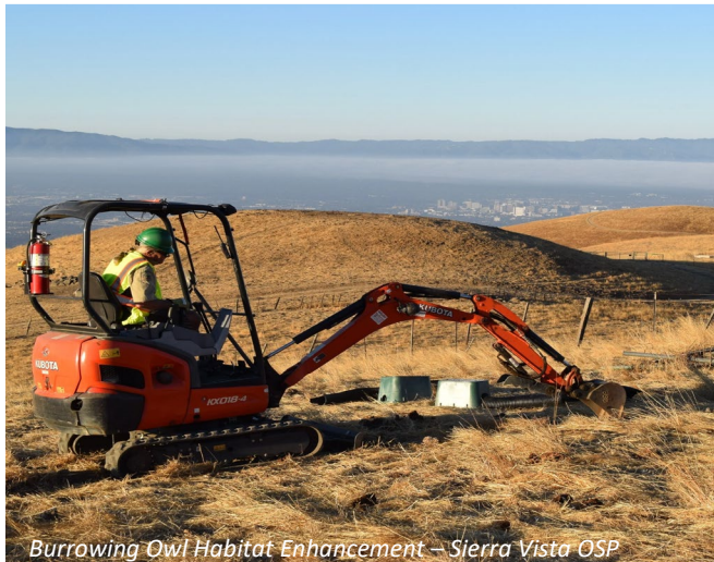
Burrowing Owl Habitat Enhancement – Sierra Vista OSP