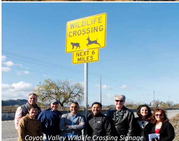
Coyote Valley Wildlife Crossing Signage