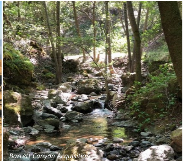
Barrett Canyon Acquisition