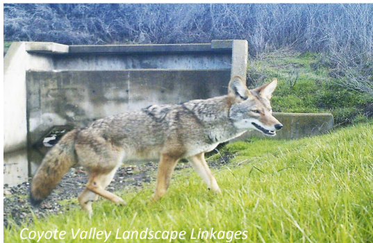
Coyote Valley Landscape Linkages

In this reported fiscal year, the Authority expended $1,595,117 on projects under this category.