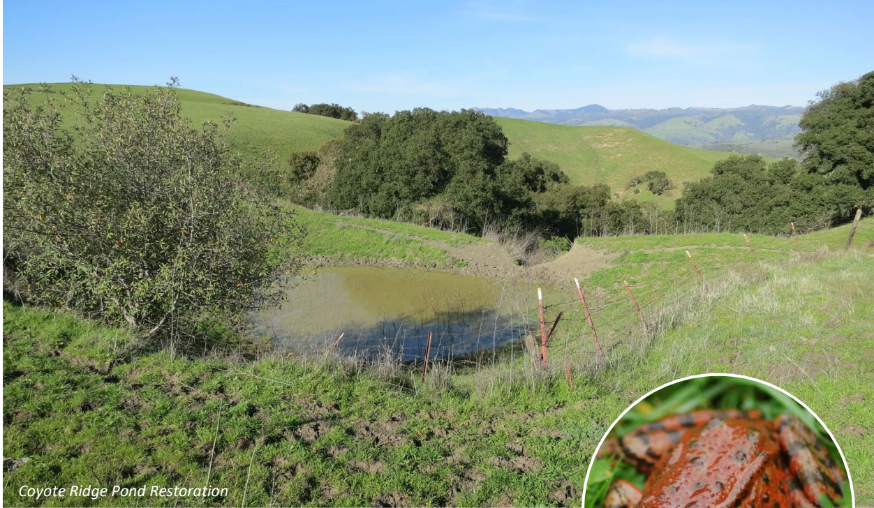
Coyote Ridge Pond Restoration

In this reported fiscal year, the Authority expended $255,784 on projects under this category.