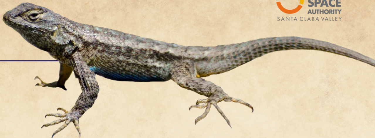
SOUTHERN ALLIGATOR LIZARD