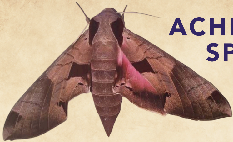
ACHEMON SPHINX MOTH